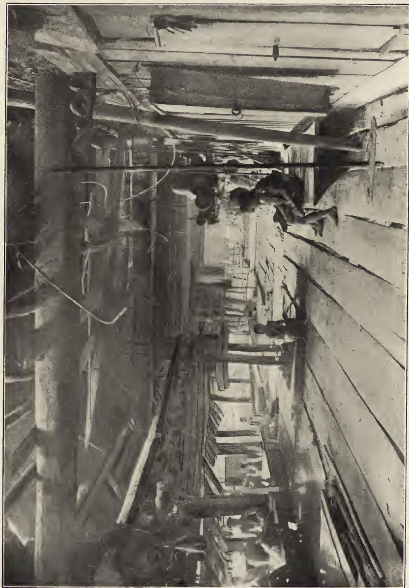
A KAYAN LONG-HOUSE.