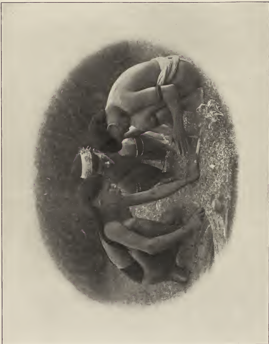
MAKING FIRE WITH A FIRE-DRILL.