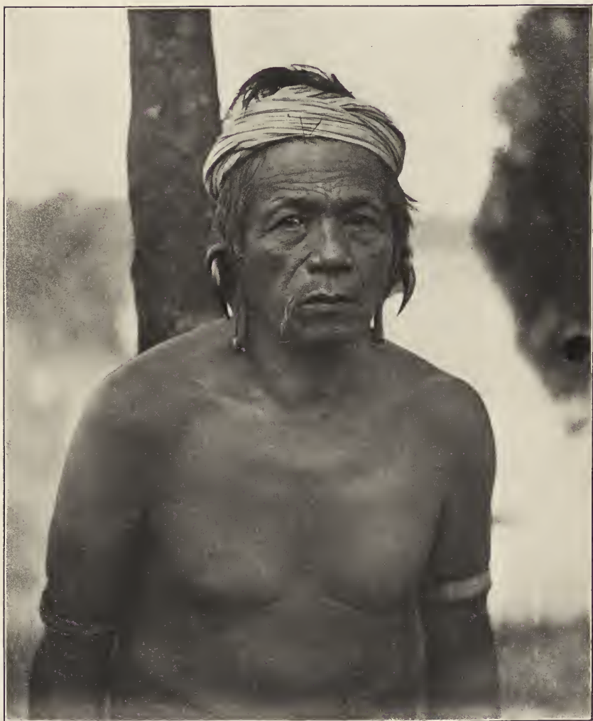
A KAYAN CHIEF.