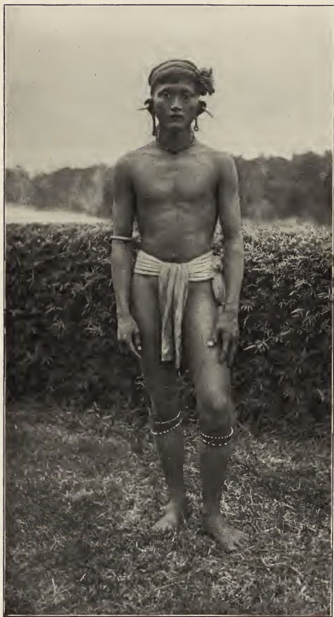
A KAYAN YOUTH.