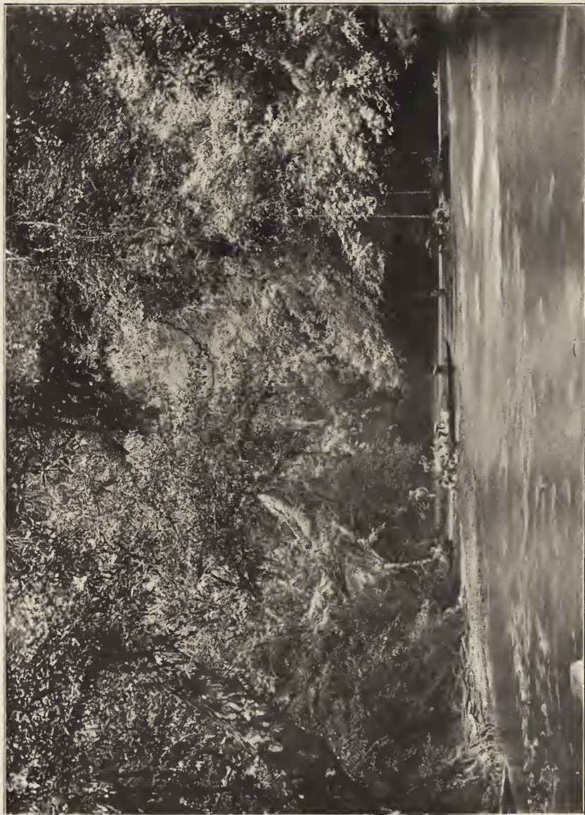
A SCENE ON THE DAPOI RIVER.