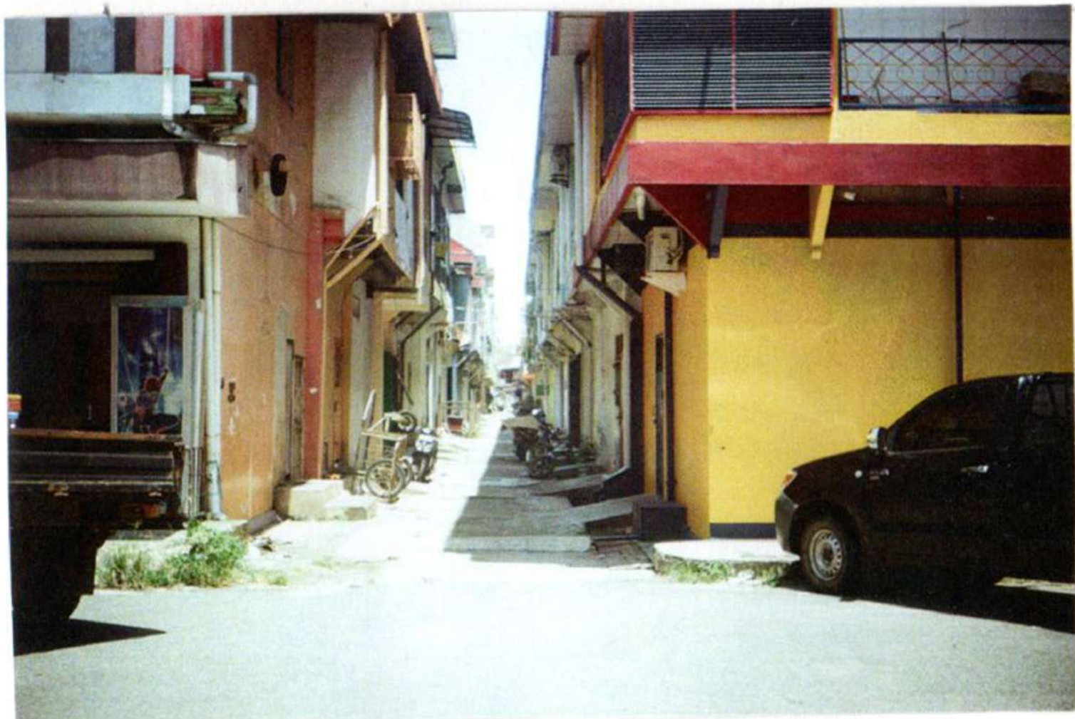
shophouses (ii), 2017