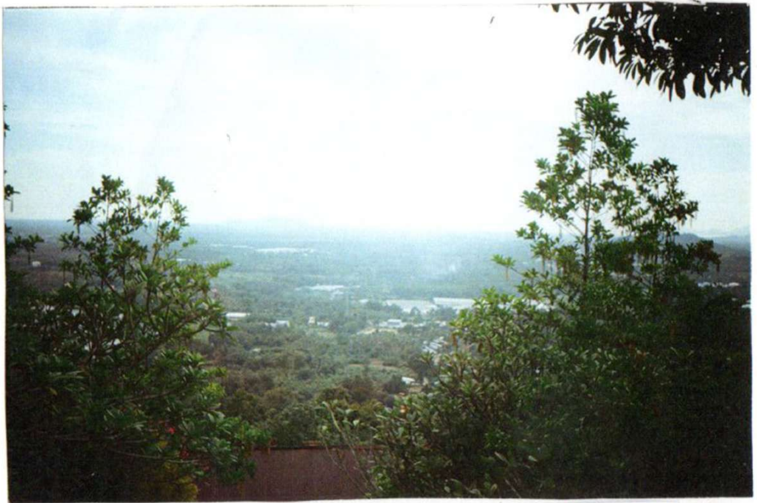
A view from "Vihara Surga Neraka", 2017