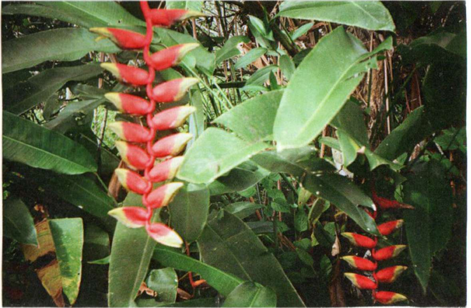
Heliconia Rostrata, 2017