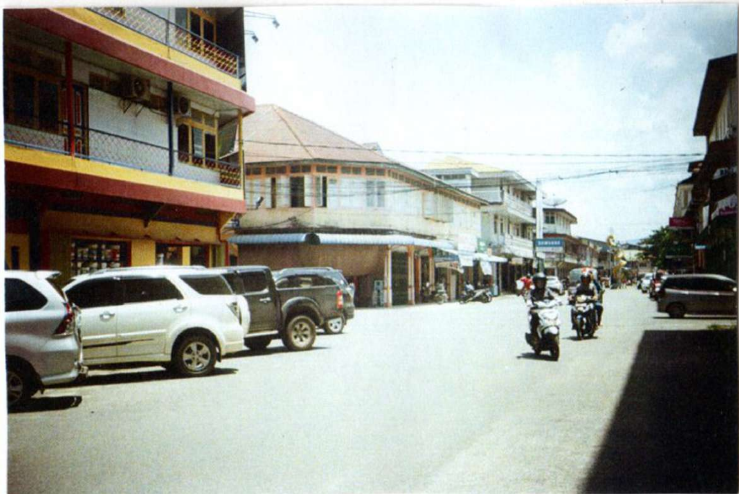
shophouses (i), 2017 |