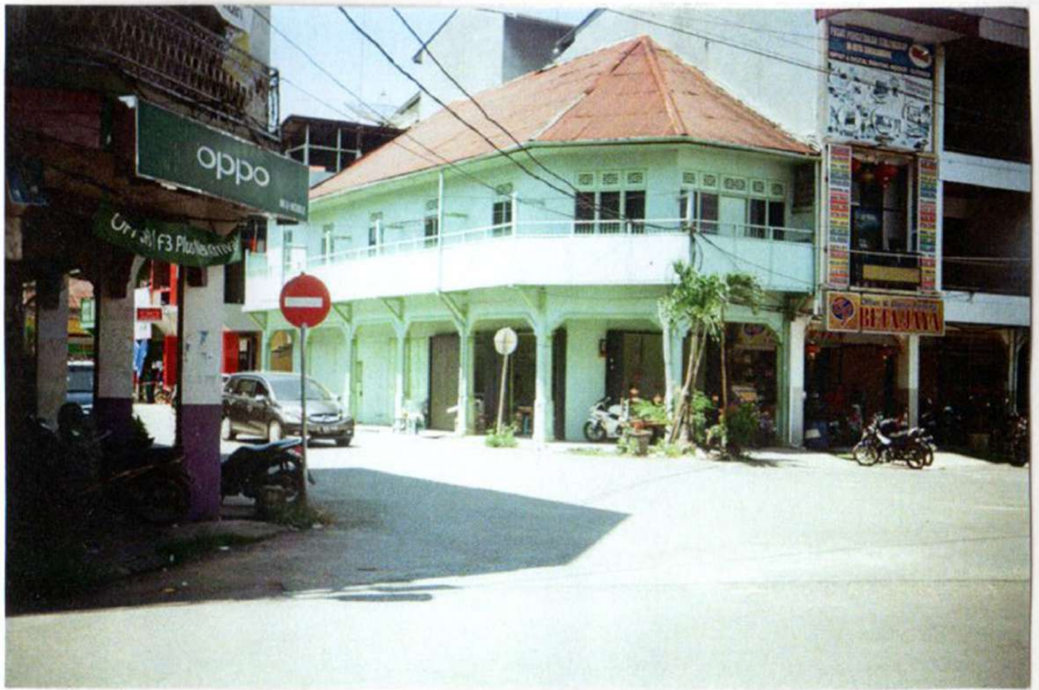
Shophouses (iii), 2017